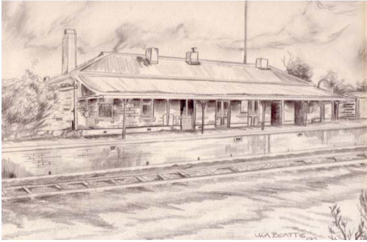
The Eaglehawk Railway Station. Now a Community Employment Centre.